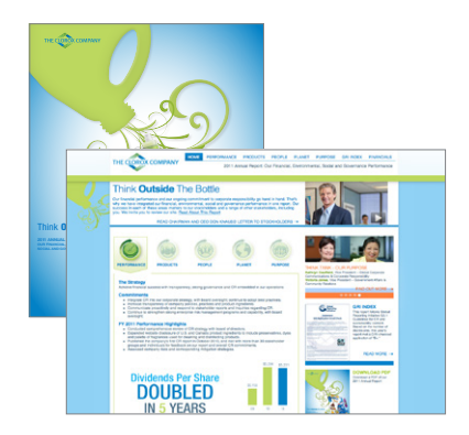
Clorox is participating in a pilot program to help develop international standards for integrated reporting.

Some companies opt to streamline reporting as a cost savings measure, while others demonstrate how sustainability is intertwined with their bottom line. With no true standard, both are fine approaches. Three examples: Pfizer uses a robust website that integrates the GRI and 10-K; United Technologies creates a robust printed report with full financials and a website to support it; Southwest uses the triple bottom line structure with a 10-K, the GRI and CDP,<sup>5</sup> as well as external assurance. It is notable that all integrated reporters are making use of the web with an interactive component to their reports.