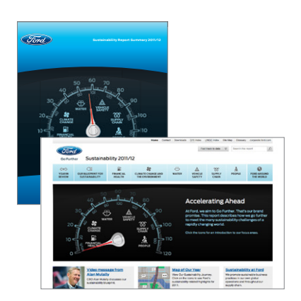
Ford's 2011 Sustainability Report consists of a robust website and a printed summary report. The site is data rich, includes third party voices and uses the GRI.