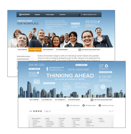
Qualcomm 's 2011 Social Responsibility Report is online-only and mobile optimized. The site offers a custom PDF report builder and uses the GRI.