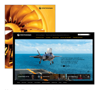
United Technologies ' 2011 integrated Annual Report consists of a traditional printed report as well as a robust website. They were among the first US companies to adopt integrated reporting.