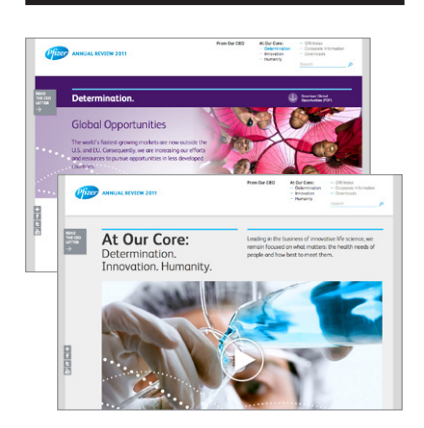
Pfizer's 2011 Annual Review is a robust online-only integrated report with videos and the GRI.