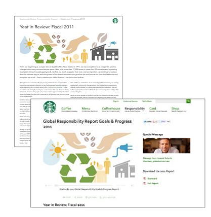
Starbucks ' 2011 Global Responsibility Report is a video laden website with a PDF download available. The company also offers a PDF scorecard showing progress against their goals.