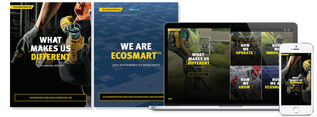
Stanley Black & Decker