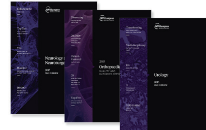
NYU Langone Medical Center