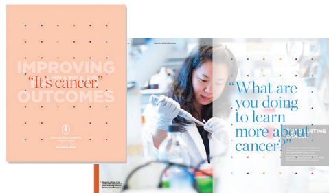
Memorial Sloan Kettering Cancer Center